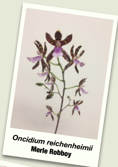
Oncidium reichenheimii Merle Robboy