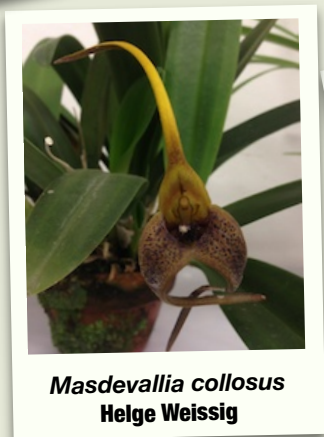
Masdevallia collosus Helge Weissig