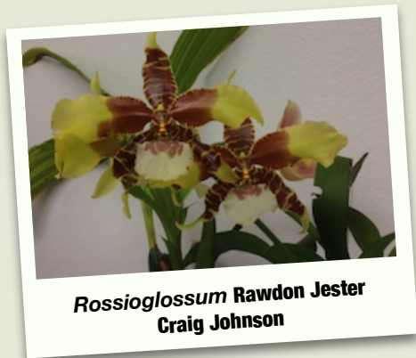
Rossioglossum Rawdon Jester Craig Johnson