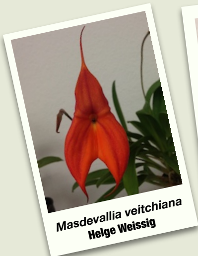
Masdevallia veitchiana