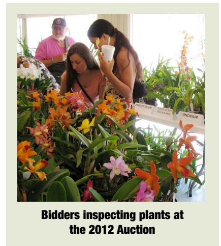
Bidders inspecting plants at the 2012 Auction