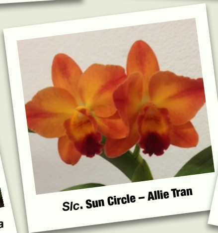
Slc. Sun Circle – Allie Tran